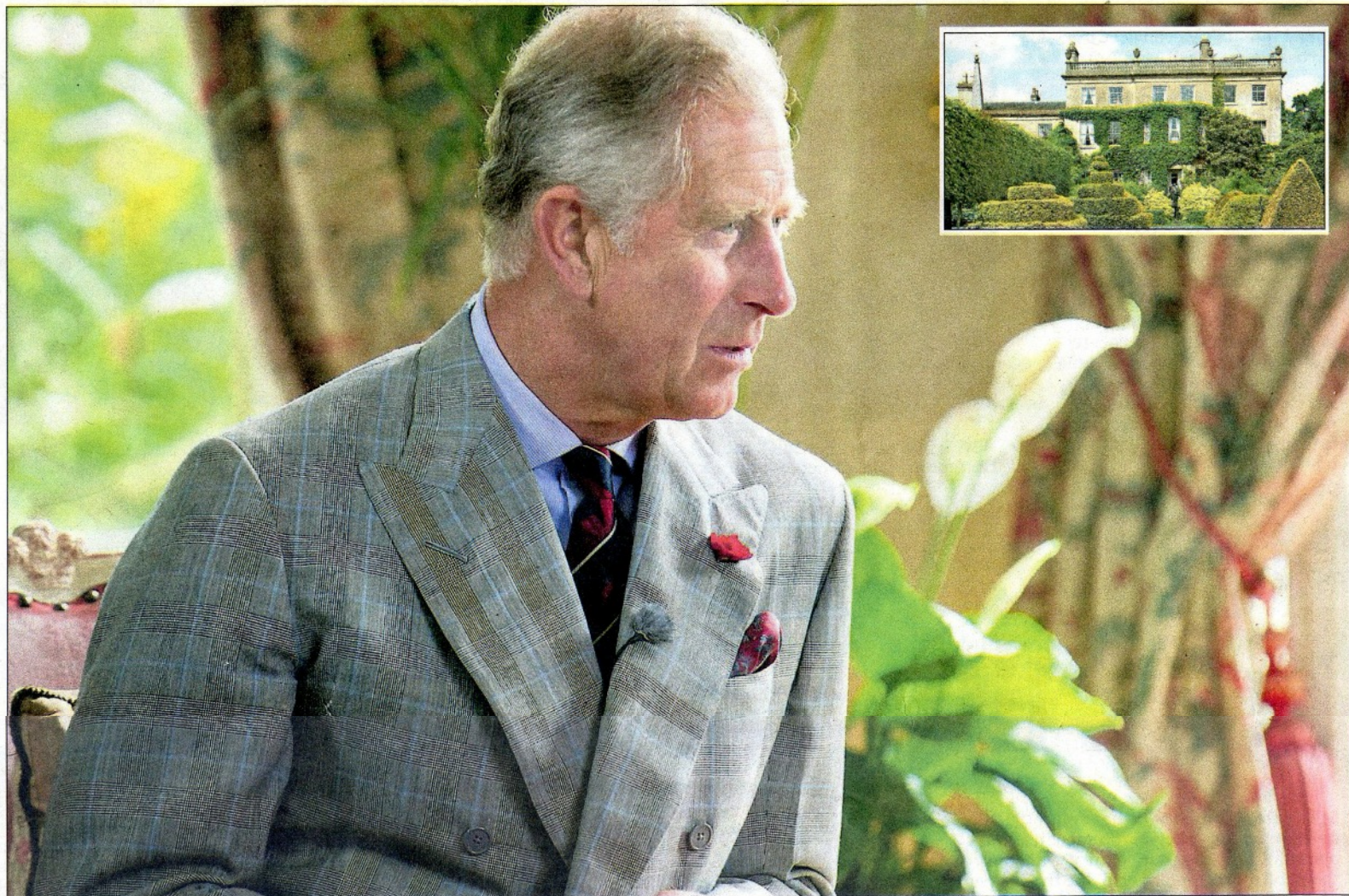
FILMING: The Prince of Wales and, inset, Highgrove House.

"We dug holes in the ground to put in five lock-off posts where we could set up a camera for a giant time-lapse shot and he wasn't precious about it at all," he said. "It was entirely his idea, so he was happy to have us